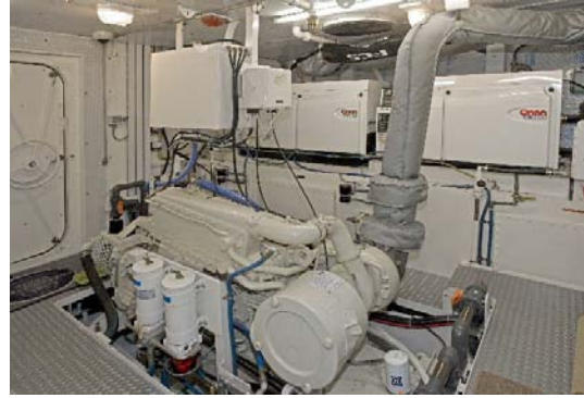
Engine room for Custom Steel '82 - Firwin Insulation Blankets on exhaust piping of twin Cummins engines

As the price for these boats typically run into the millions (the Custom '82 recently sold for $5.3 million), what kind of clientele does Custom Steel Boats attract?