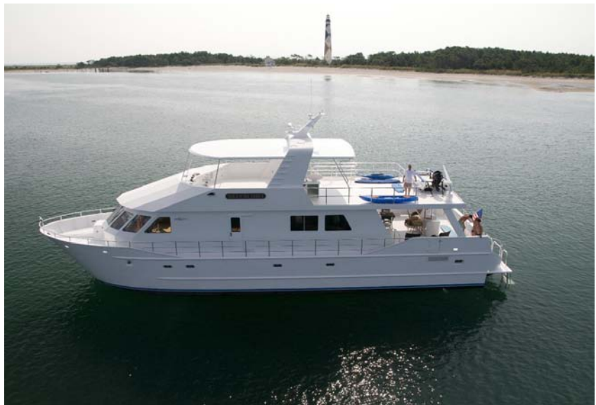
Boundless '90 High Speed House Boat